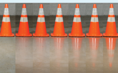
Shiny, Restored Flooring