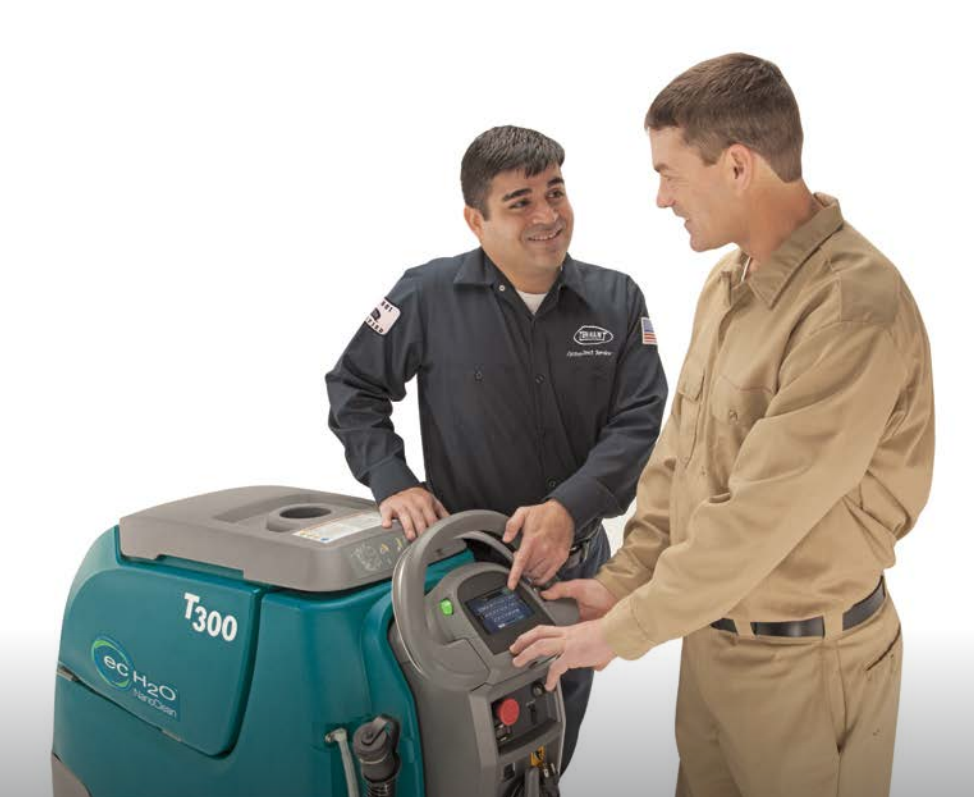
* Included parts vary by program