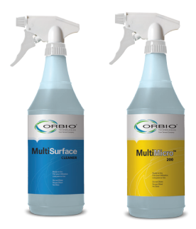
MultiSurface Cleaner & MultiMicro 200 sanitizing/ disinfecting solution

The os3 system provides on-site generation (OSG) of cleaning and disinfecting/sanitizing solutions that can replace multiple conventional packaged chemicals.