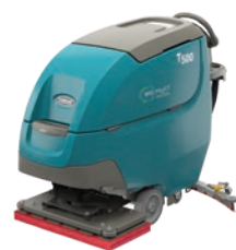
Orbital: 28 in / 700 mm