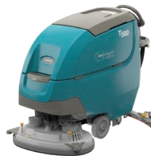
Dual disk: 26 in / 650 mm & 28 in / 700 mm & 32 in / 800 mm