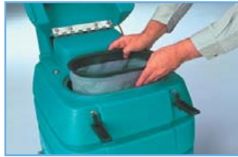
Easy-to-access cloth and paper vac bags on the 3500 can be changed with the flip of the lid.