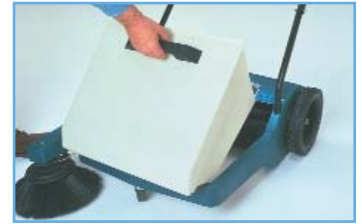
The 3600 (110) sweeper employs a lightweight lift-off hopper that is easy to empty and has a large storage capacity.