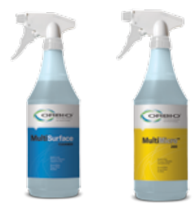
MultiSurface Cleaner & MultiMicro 200 disinfecting/ sanitizing solution

The os3 system provides OSG of cleaning and disinfecting/sanitizing solutions that can replace multiple conventional packaged chemicals.